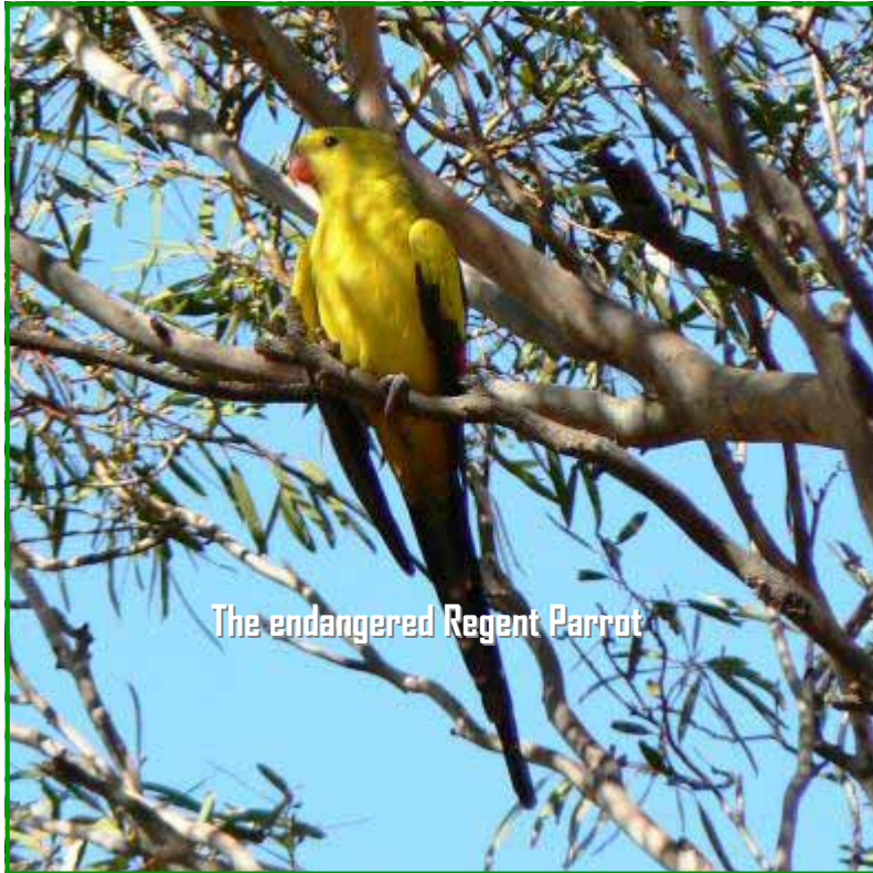
The endangered Regent Parrot